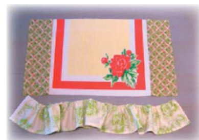
Step 2 & 3