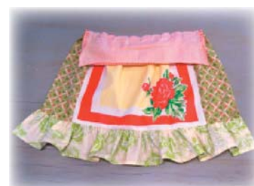
Step 5 & 6